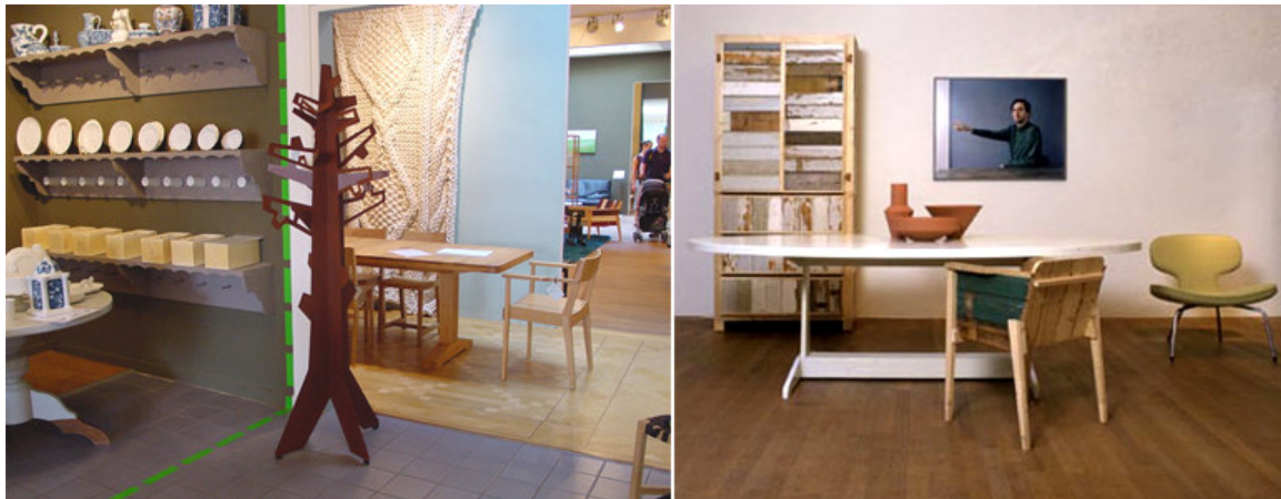
(The Frozen Fountain)

After Tokyo, Papabubble has opened store in Amsterdam. Let your dreams turn into sweet reality and enjoy the hand-made sweets, lollies and other flavoured shapes and delicious objects.